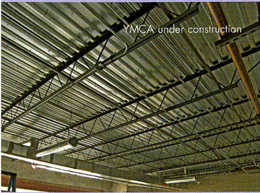
YMCA under construction