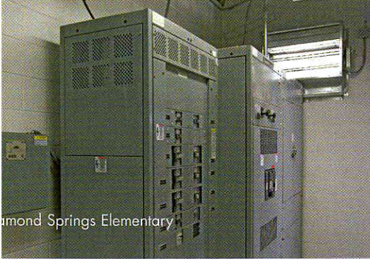
Diamond Springs Elementary

Commercial electrical work focusing on healthcare facilities, schools, office buildings and churches We work throughout the Hampton Roads area and on the Eastern Shore and down into North Carolina